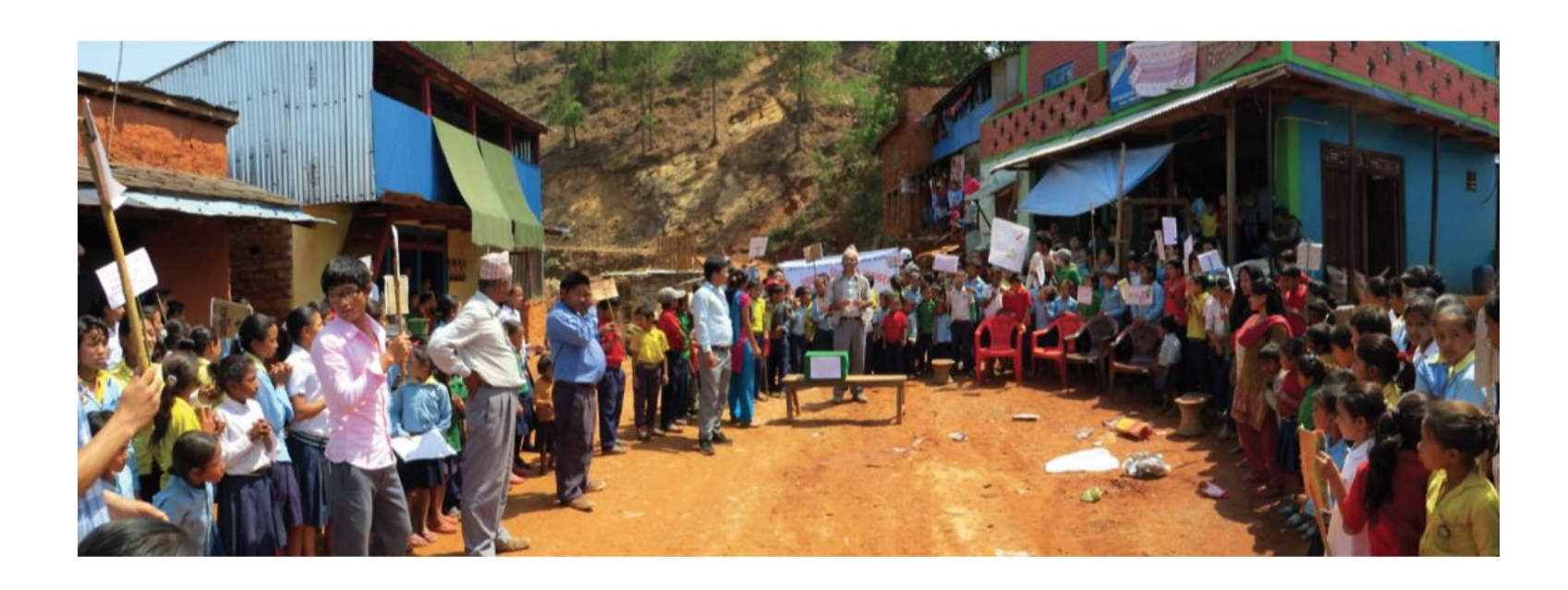
Youth Business International