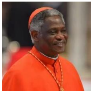
His Eminence, Peter K.A. Cardinal Turkson | Twitter: @CardinalTurkson Prefect, Dicastery for Promoting Integral Human Development

Our diverse roster of speakers from Church and sector leadership, successful social enterprises, family foundations, and bi-lateral donor agencies offer a rich perspective on how private capital can be used to lift people around the world out of poverty.