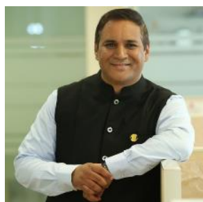
Vineet Rai Founder, Aavishkaar-Intellectap Group

For more than 20 years, they have been building the infrastructure, networks, and relationships to invest nearly $2 billion in private capital into communities in the US and roughly 100 countries around the world. Individuals and institutions invest through Calvert Impact Capital's Community Investment Note, a retail fixed-income security and syndication service. In 2016, the entities in Calvert Impact Capital's portfolio made roughly 5 million investments through which they deployed approximately $7.6 billion to individuals and organizations working to create a better world.